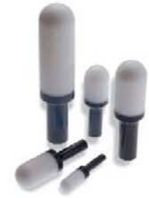
Stem or PIF silencers

Reduce the noise levels of pneumatic equipment Compact, efficient and lightweight Insert directly into Push-In Fitting exhaust port Prevent the ingress of dirt